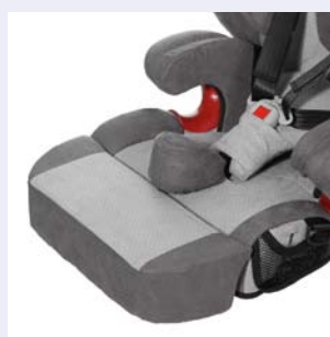
Abduction block and seat depth extension