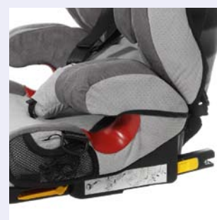
Model Seatfix with integrated Isofix arms for an optimum protection in case of accidents