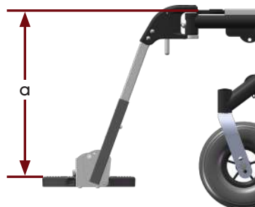
Table 2 - Functional length, angle adjustable leg rest [cm]. Measured from top of seat plate to top of footrest plate.