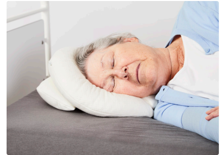
The LeanOnMe Mini can be placed where smaller gaps occur.