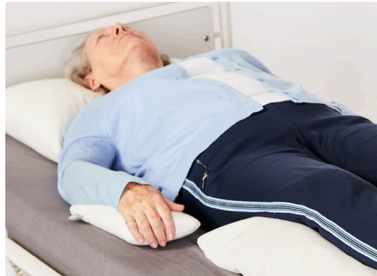
Use a LeanOnMe Mini for relieving oedema by elevation and open the hand.