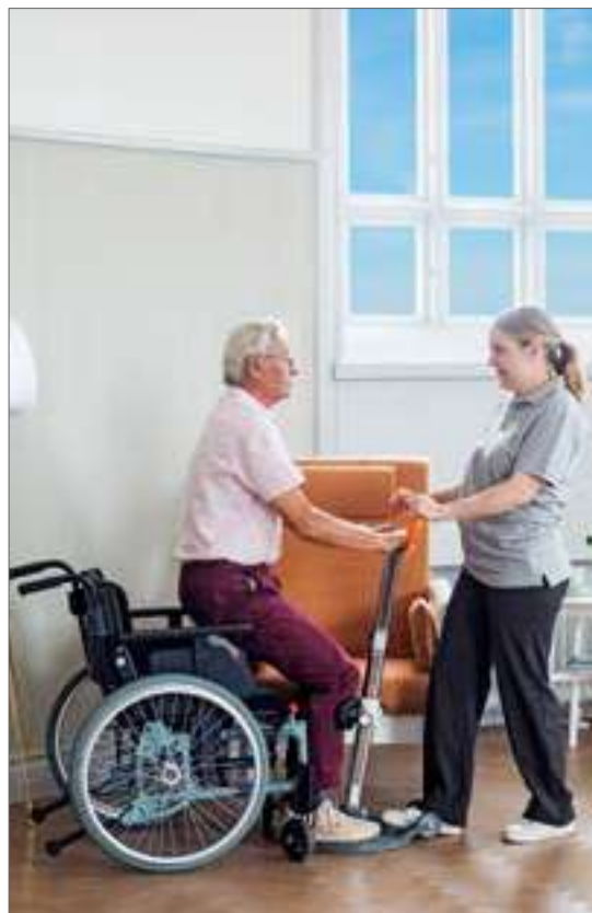
A safe transfer which allows eye contact and good communication.

The Turner PRO works well on different flooring materials including carpets.